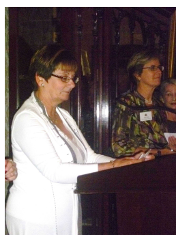
The Short List is announced

On the Tuesday before we flew out of Adelaide we attended the Short List announcement at the Adelaide Town Hall. This historic building was also hosting a display of artwork by many well known illustrators. I was proud to be the announcer for the Older Readers category at this reception. It is a tradition that outgoing judges read out one section of the Short List. This year the new judges held up the books as they were announced. Each night we were taken out to a restaurant for a meal in different areas of West Adelaide.